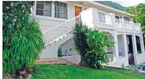
Manoa Multi-Dwelling $1,295,000 FS Aiea Heights ~ Upcoming!