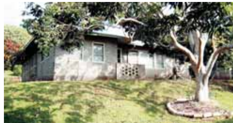
2/1 1,061 sf Living Area, 10,000 sf lot