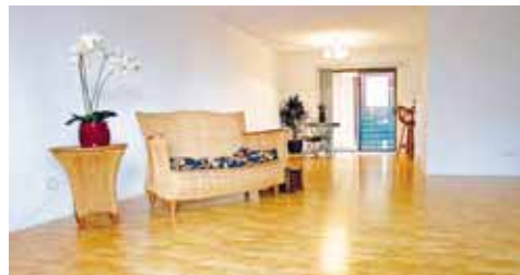
Kawaihae Crescent East 3/2 $489,000 (FS)