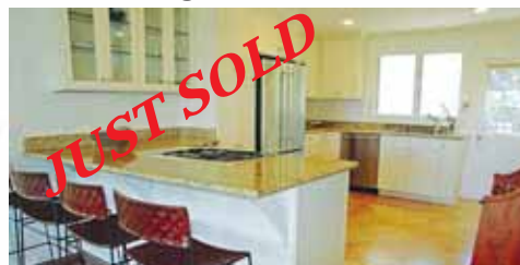
Island Charm! 4/2 Sold at $780,000 (FS)